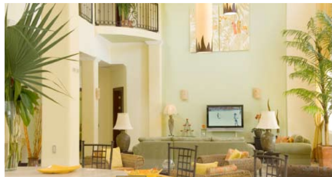
Pictured left and right: Casa de Sueños

Our condo accommodations feature living room, kitchen, bedroom, patio, TV, internet with wi-fi and a golf cart for local transport. Two and three bedroom condos also available. See information below.